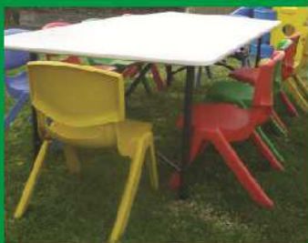
TABLE & CHAIRS

1 Foldable kids table 10 Coloured chairs